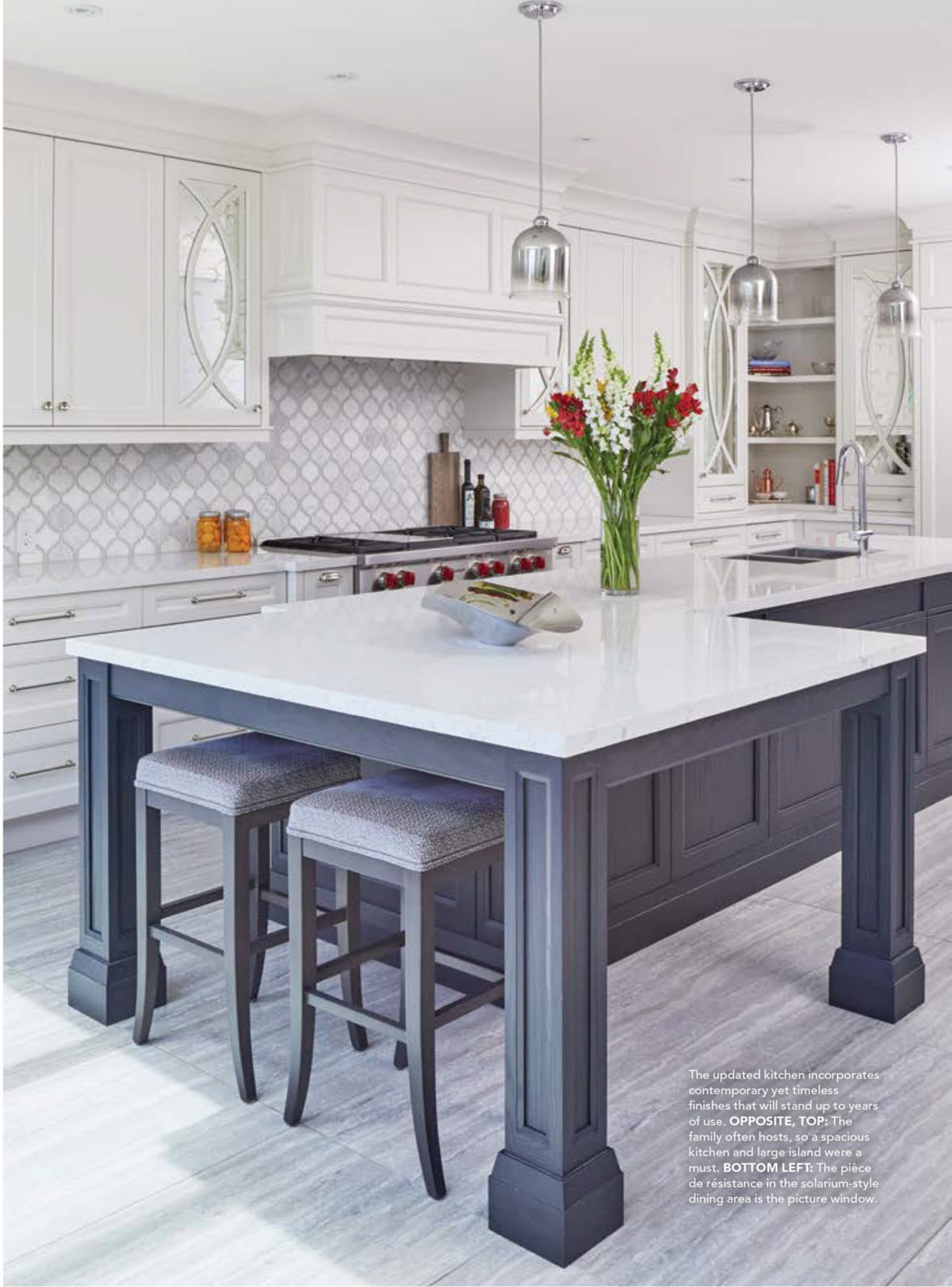
The updated kitchen incorporates contemporary yet timeless finishes that will stand up to years of use. OPPOSITE, TOP: The family often hosts, so a spacious kitchen and large island were a must. BOTTOM LEFT: The pièce de résistance in the solarium-style dining area is the picture window.