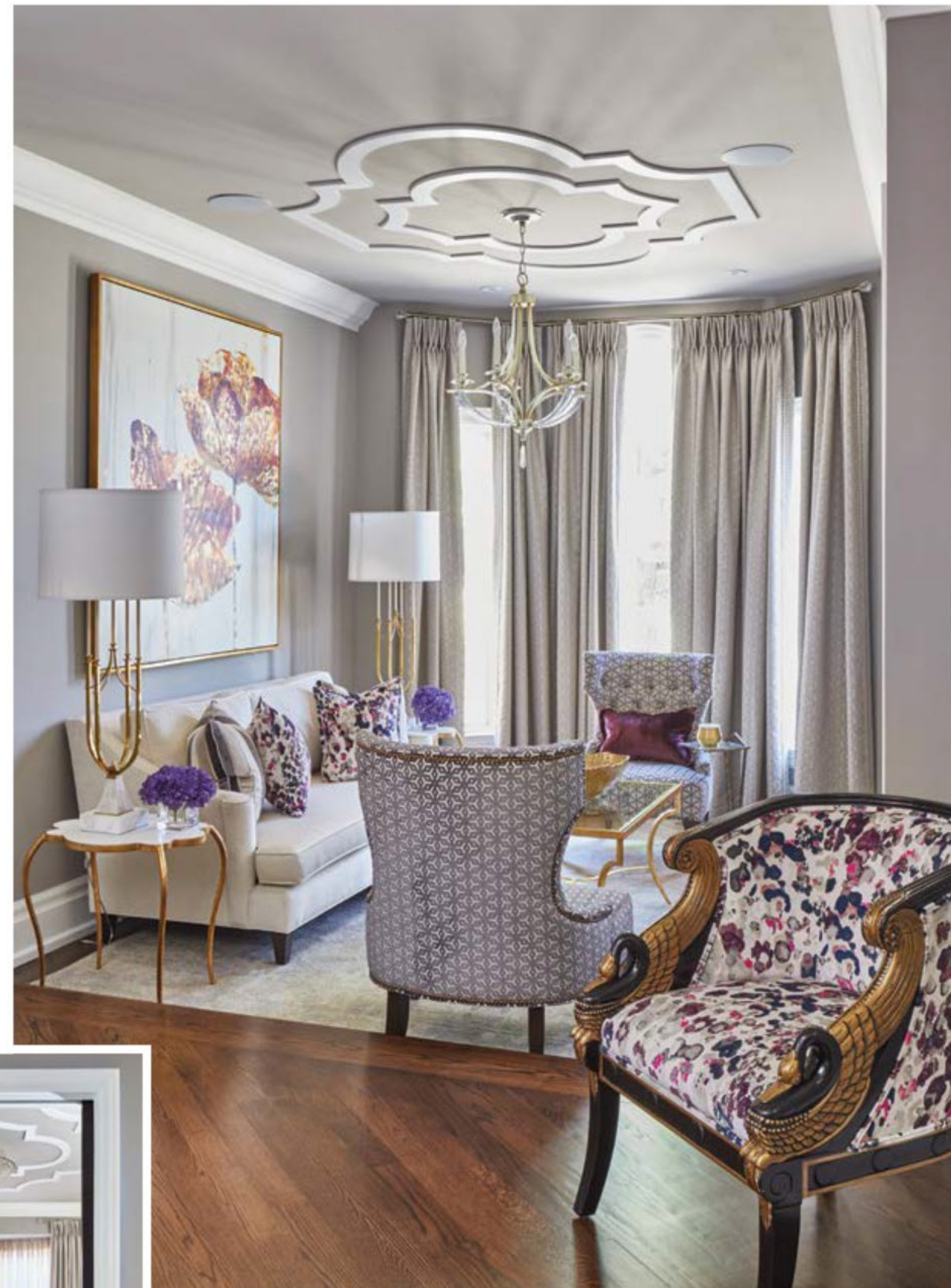
RIGHT: A more formal room in the home, the living room dazzles with layers of colour and texture. BELOW: The dining room was eliminated in favour of a piano that now takes centre stage.