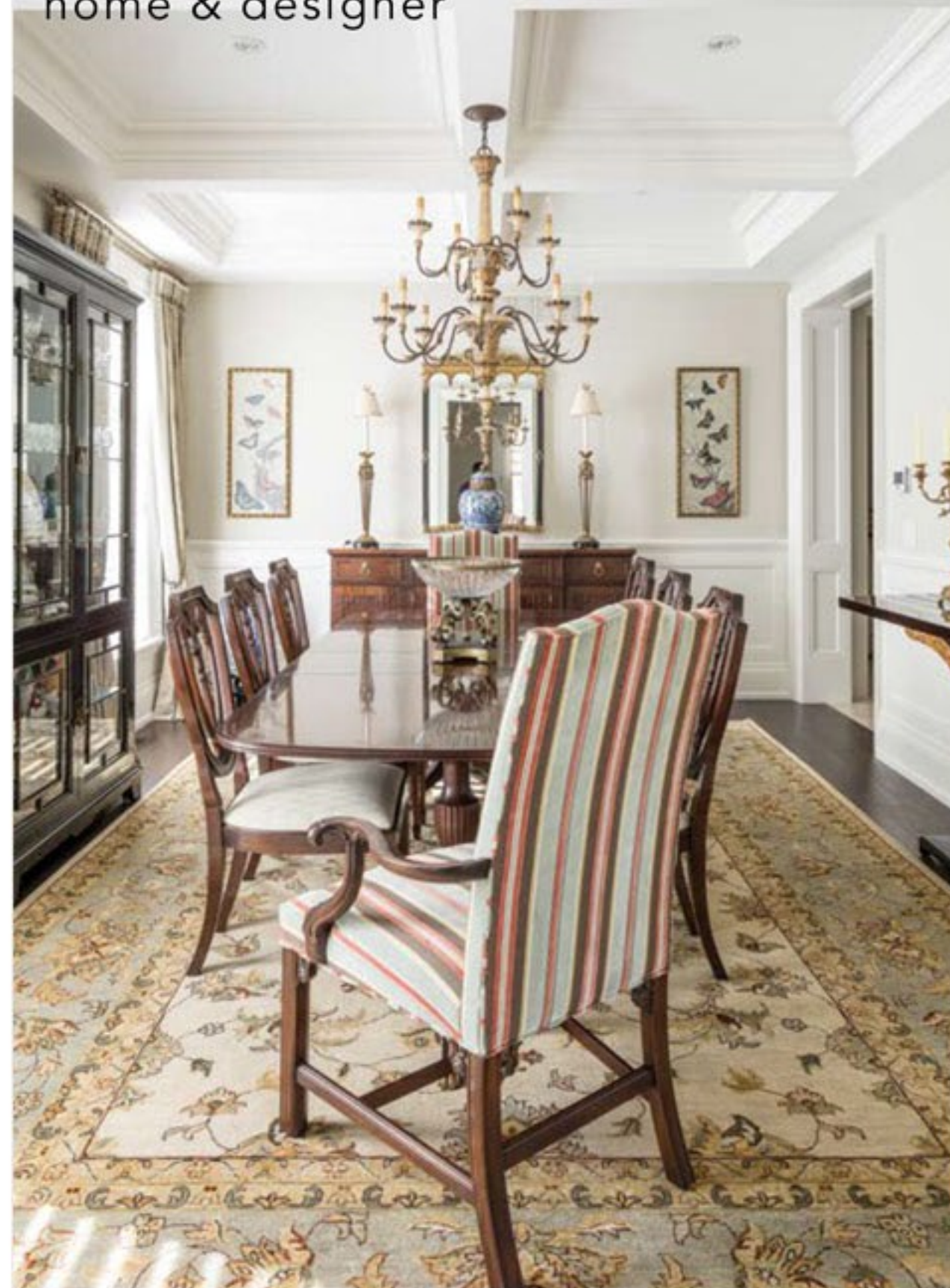
LEFT: A more traditional aesthetic adds formality to the dining room. BELOW: Candelabra-style pendants add a strong architectural element over the island. BOTTOM: Hints of gold connect the powder room to the rest of the home. OPPOSITE, TOP: Integrated appliances maintain the fresh white furniture-style look. BOTTOM: A small dining area looks on to the great room and beautiful backyard.