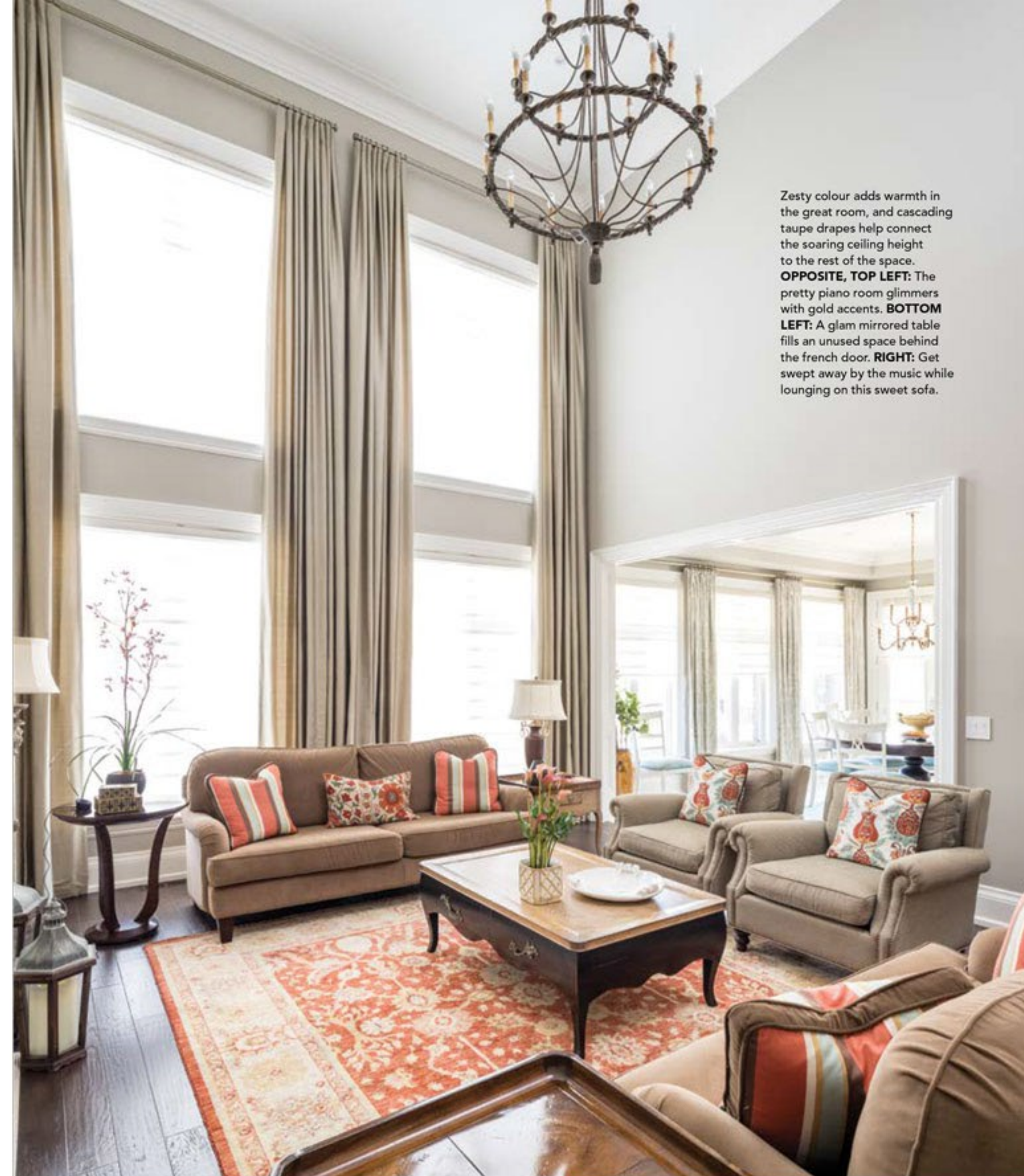
Zesty colour adds warmth in the great room, and cascading taupe drapes help connect the soaring ceiling height to the rest of the space. OPPOSITE, TOP LEFT: The pretty piano room glimmers with gold accents. BOTTOM LEFT: A glam mirrored table fills an unused space behind the french door. RIGHT: Get swept away by the music while lounging on this sweet sofa.

Timeless design is understated, simple and sophisticated, but it doesn't have to be bland and boring. Take a peek inside Patricia Wong's home, where classic blends with hints of contemporary for a balance that's functional and beautiful.