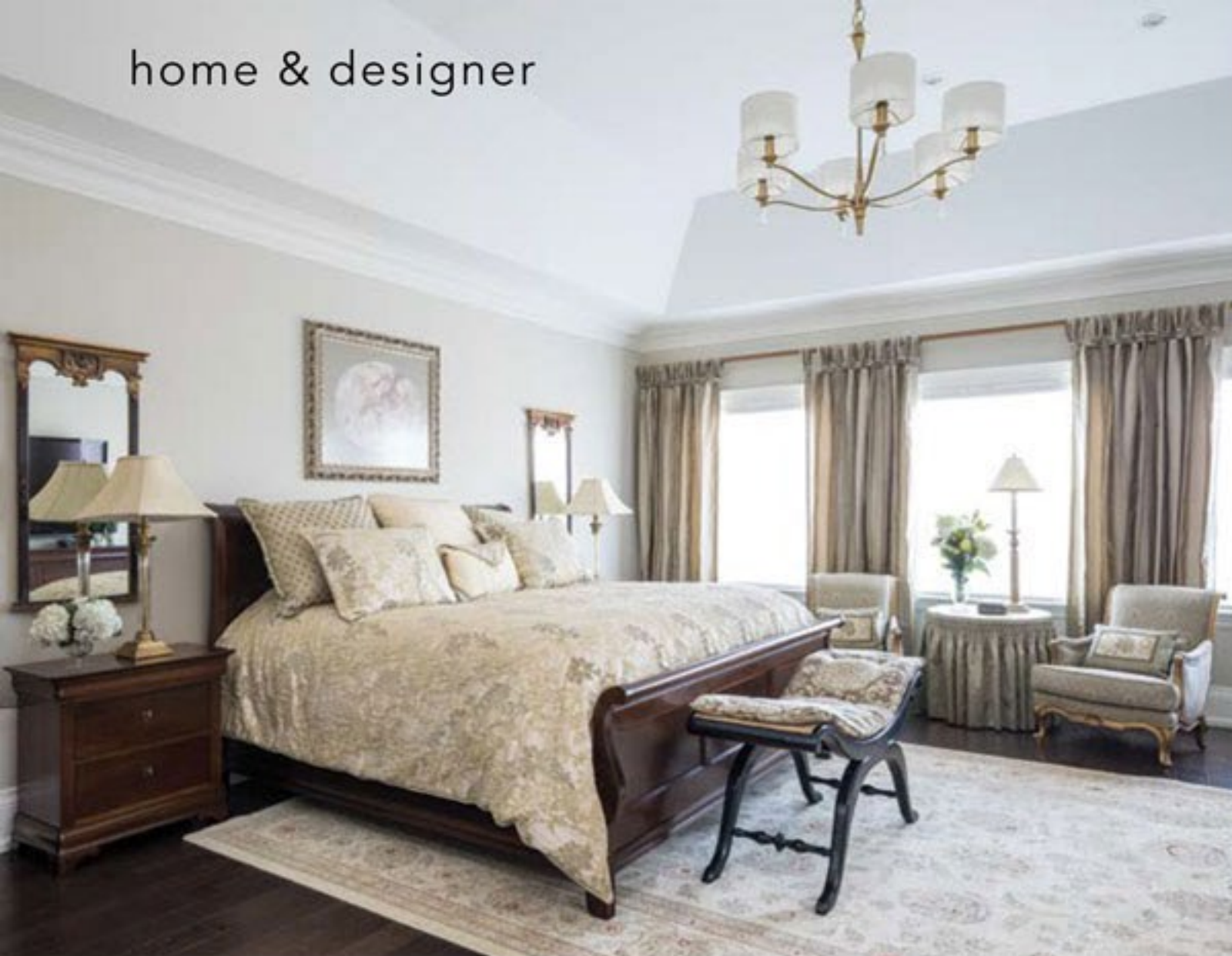
LEFT: The master bedroom is soft and pretty with layers of textures and patterns. BELOW LEFT: The integrated vanity area is alive with natural light. BELOW: Soft and romantic, the tub is a lovely haven to soak worries away.